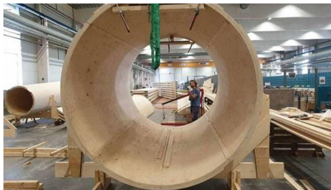
Figura 2. Diseño modular de Modvion.

Certain types of projects have managed to reach a point of effectiveness that has led them to be implemented in some parts of the world, a case in point is the Modvion project, a Swedish engineering and industrial design company that develops modular designs in wood products.