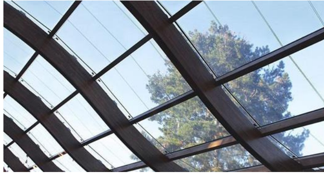
Figura 3. Vidrio voltaico producido por Onyx Solar [19]