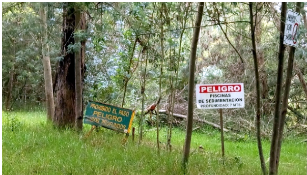
Figure 8. Diagrama OSPF con sus respectivas áreas.

Also affected are the populations that inhabit the areas surrounding the areas of exploitation, the people who live in these areas because they are suffering from various complications and endure various types of pollution, such as acoustic, thermal, soil, etc. There are current cases of people who have lost some of their senses because of these contaminations or people who have had to leave their homes because they can no longer stand the exploitation.