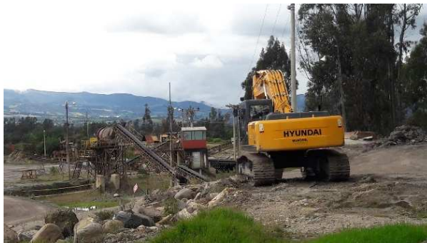
Figure 3. Exploitation of construction materials in the municipality of Guasca.

2015). In these mining titles, the restoration of areas affected by old mining exploitations is being carried out, which are not currently being exploited.