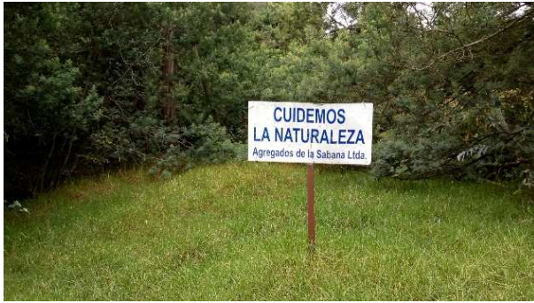
Figure 7. Diagrama OSPF con sus respectivas áreas.