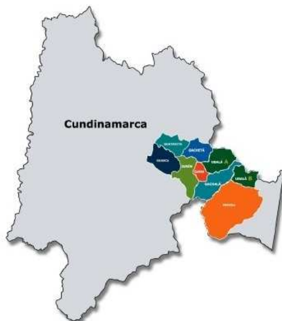
Figure 2. Geographic location of Guavio (Bojacá, Hilarión, & Bojacá, 2018).

To focus this issue on the region, it is necessary to contextualize it a bit (Fig. 2).