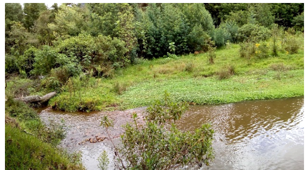
Figure 6. Diagrama OSPF con sus respectivas áreas.

Mining is taking over more and more of the territory, but what is worrying is that this is being accentuated on water sources such as moors, rivers, and streams; this means that not only is the water resource diminished due to the greenhouse effect, pollution, massive cattle raising, the cutting down of trees and the reduction of the areas in charge of storing it, but it is also affected by the mining that is carried out on it since it contaminates a great part of the vegetable cover that is in charge of storing and providing the resource to the beings of the area (Figs. 6, 7 and 8).