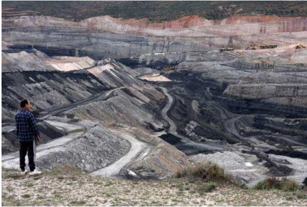
Figure 1. Cerrejón coal mine (Contagio Radio, 2018).