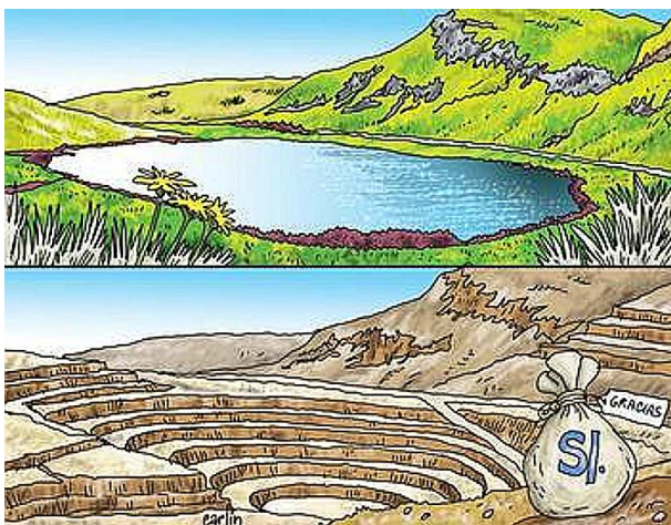
Figure 4. Environmental pollution (Periodico Nueva Región, 2017).

In 2005, a judge indicated that, although the failures in their housing could be due to vehicle traffic, they were also a product of the irregular terrain where it is built. However, as far as noise is concerned, the Municipal Court of Appeals agreed: it ordered the owner of the sandpit to shut down his crushing plant and plant a tree barrier to reduce the noise (Fig. 4) (Guerrero, 2017).